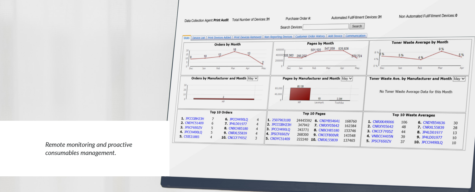
Remote monitoring and proactive consumables management.