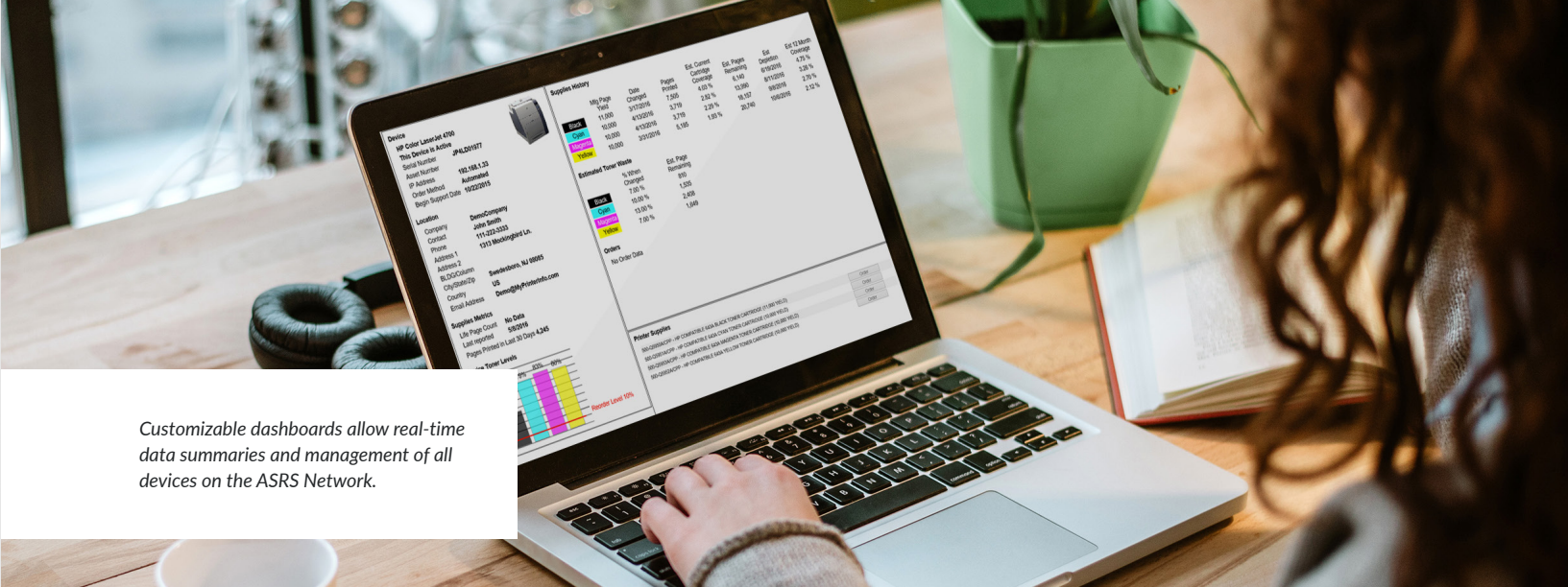
Customizable dashboards allow real-time data summaries and management of all devices on the ASRS Network.