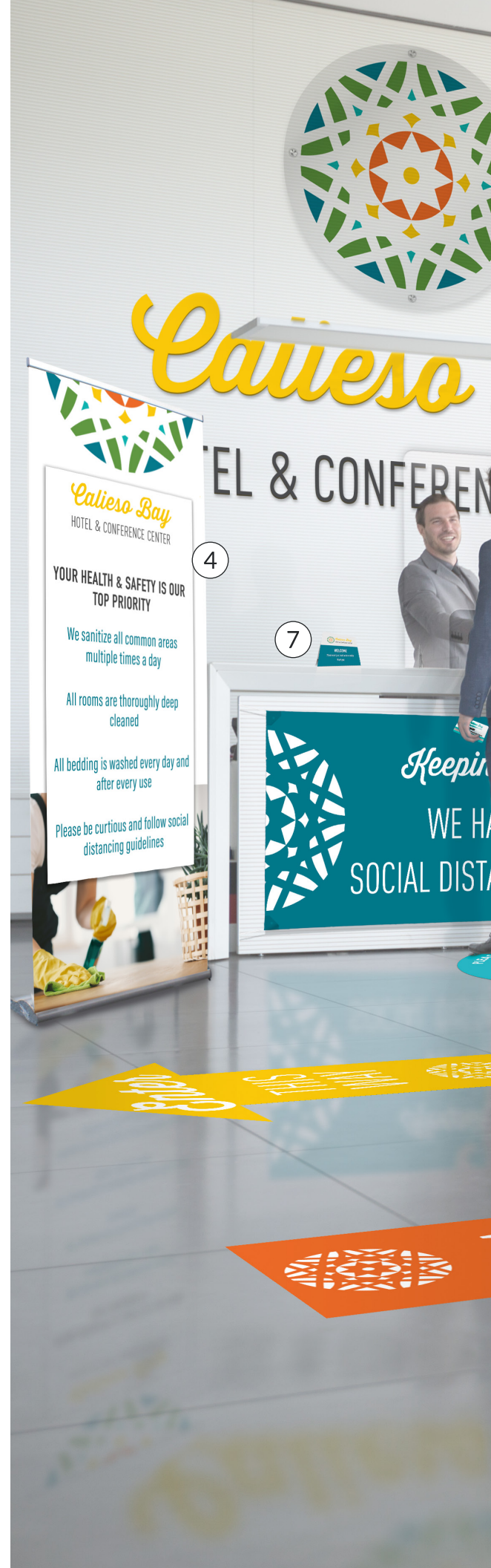
Table tents let you share important messages where they're needed most.