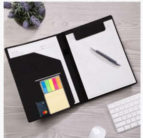
SANDEL PORTFOLIO W/STICKY NOTES & NOTE PAD