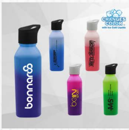
MOOD 24 OZ. EDGE BOTTLE WITH CARRY CAP