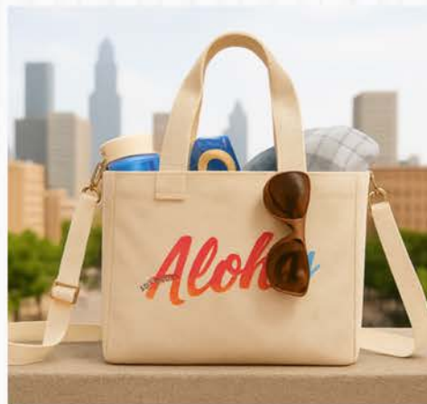
LONDON SMALL RECYCLED SHOPPER TOTE