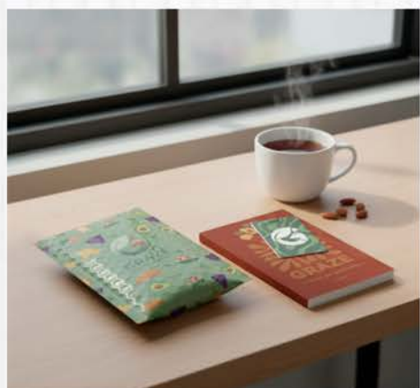
THE WAYFINDER KIT