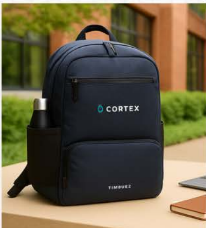
TIMBUK2 CITY COMPASS CORE PACK