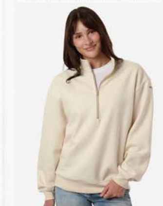
COLUMBIA WOMEN'S ALDERMORE HALF ZIP PULLOVER