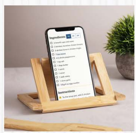
CHUN BAMBOO KITCHEN TRIVET/PHONE HOLDER