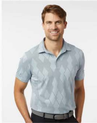
ADIDAS MEN'S ULTIMATE365 TEXTURED POLO