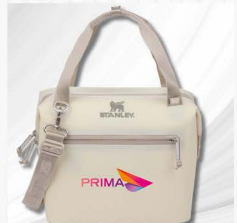
STANLEY JULIENNE MINI 10 CAN COOLER