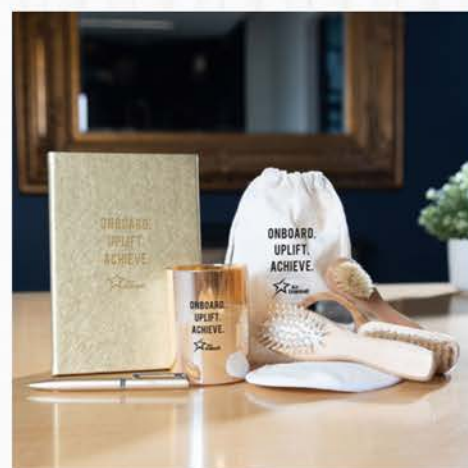
MINDFUL BEGINNINGS ONBOARDING SET