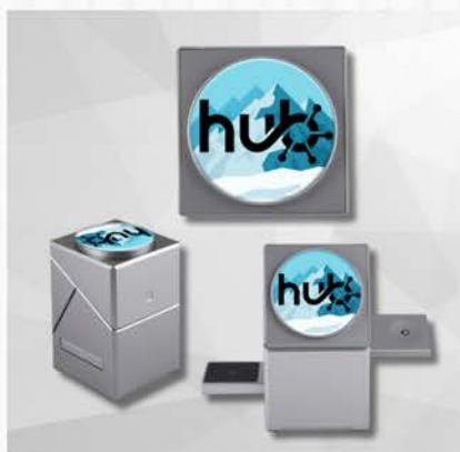
POWERPIVOT 3IN1 WIRELESS CHARGER