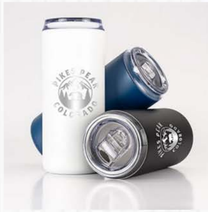
SARATOGA SLIM TUMBLER 20 OZ