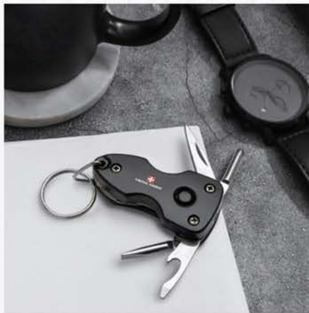
SWISS FORCE® WILDCUB MULTI-TOOL & FLASHLIGHT KEYRING