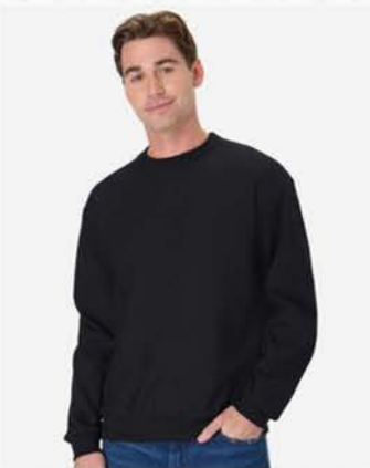
UNISEX BEEFY® SWEETS PREMIUM HEAVYWEIGHT CREWNECK SWEATSHIRT