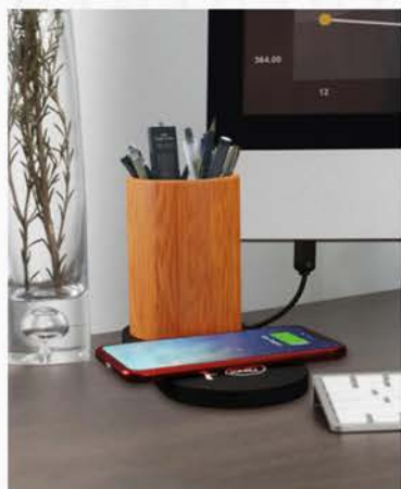
SCX INNOVATIVE DESIGN™ DESK ORGANIZER WITH 10W CHARGING BASE