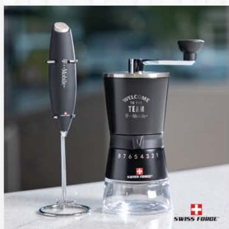
SWISS FORCE® MORNING BREW GIFT SET