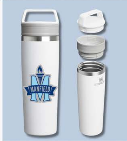
STANLEY CAFÉ-TO-GO TRAVEL MUG 20 OZ