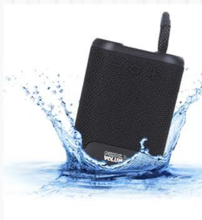
WATERPROOF BLUETOOTH® SPEAKER WITH SUBWOOFER