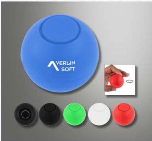
FUN SPINNER FIDGET BALL