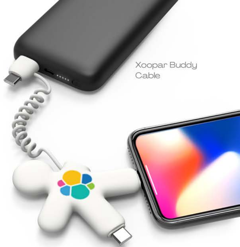
Xoopar Buddy Cable