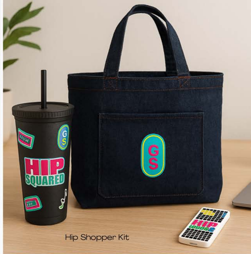
Hip Shopper Kit