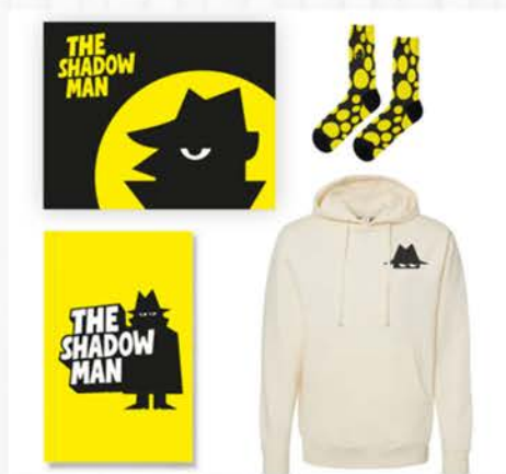
LOUNGE & JOT KIT