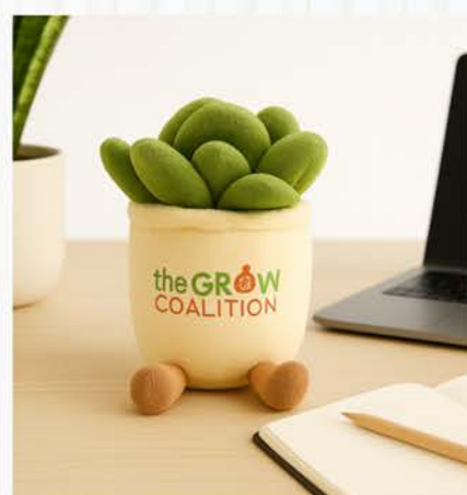
CHELSEA TEDDY BEAR™ ZENZIES 7" TO 9.5" PLUSH