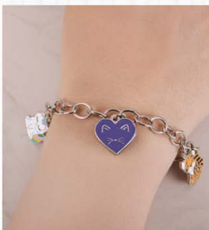
DIESTRUCK 3 CHARM BRACELET