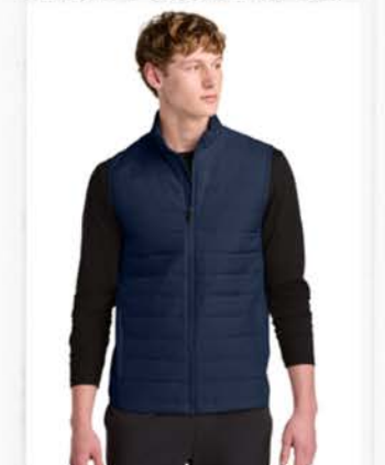
SPORT-TEK® TEKNICAL HYBRID VEST