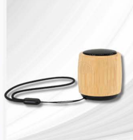
REED MINI CIRCLE WIRELESS SPEAKER