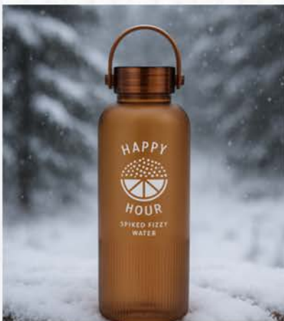
PRISM24OZ RECYCLED PLASTIC SPORTS BOTTLE