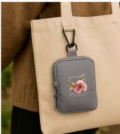
PUFFER RECYCLED SMALL POUCH