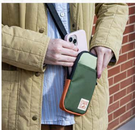
DURAGRID PHONE SLING BAGS