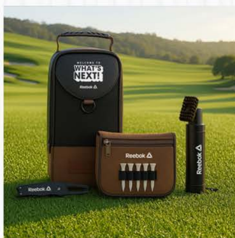
FAIRWAY GIFT SET