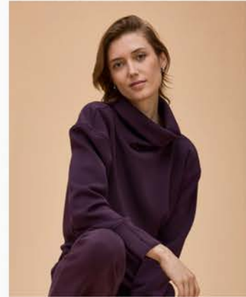
WOMEN'S COMFORT ZONE SUPER SOFT MODAL BLEND FUNNEL NECK