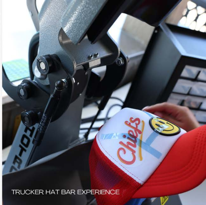
TRUCKER HAT BAR EXPERIENCE