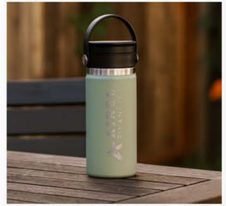
HYDRO FLASK® WIDE MOUTH 16 OZ BOTTLE WITH FLEX SIP LID™