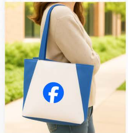
ARLO RPET TOTE