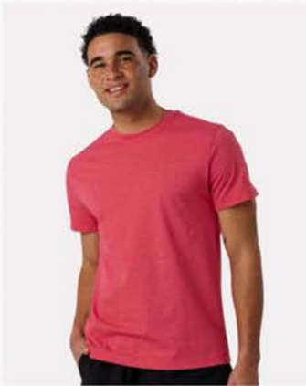
RECOVER MEN'S ECO T-SHIRT