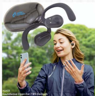
SOUNDWAVE OPEN EAR TWS EARBUDS