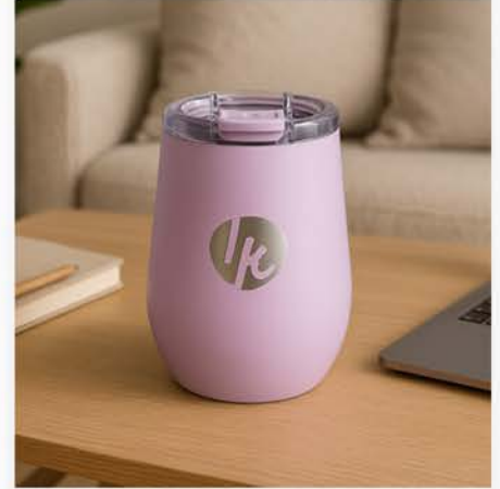
14 OZ. BRÛMATE UNCORK'D FASHION COLORS