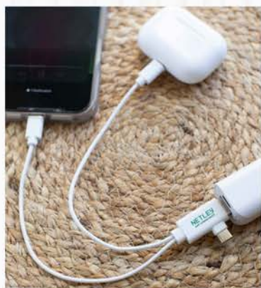
5-IN-1 RECYCLED CHARGING CABLE