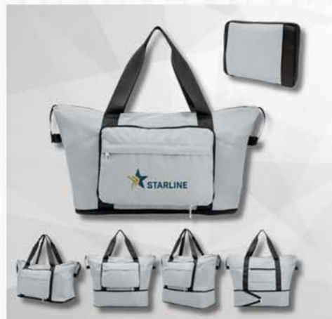
ANYWHERE RPET EXPANDABLE DUFFEL BAG