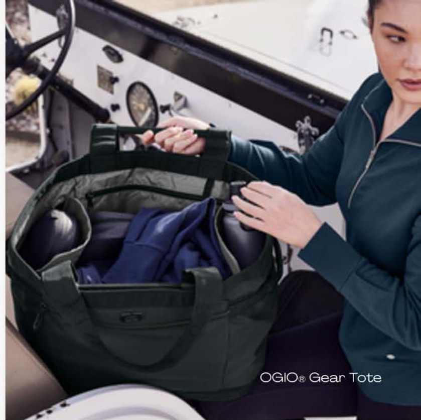
OGIO® Gear Tote