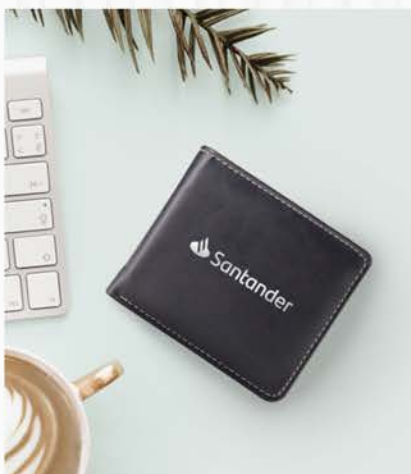
VERNIER CACTUS LEATHER WALLET