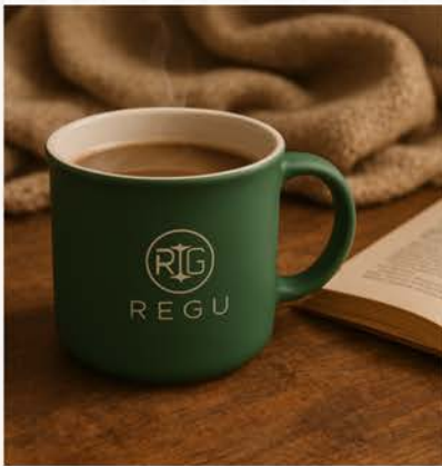
15 OZ. SOFT TOUCH CAMPFIRE MUG