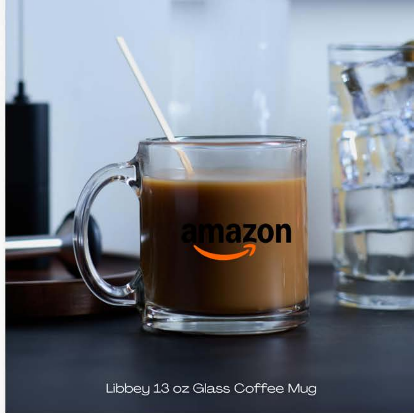
Libbey 13 oz Glass Coffee Mug